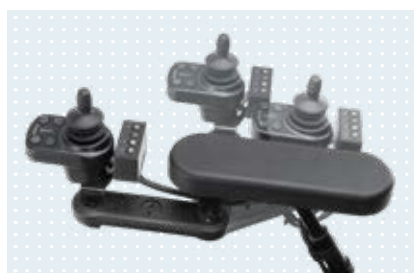
• Parallel swing away control panel holder