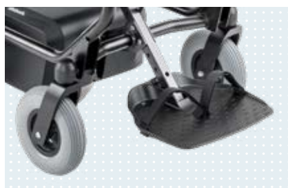
• Positioning belts for the feet