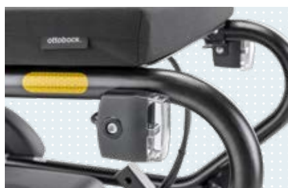
• Electric lighting according to German Motor Vehicle Safety Standards (StVZO)