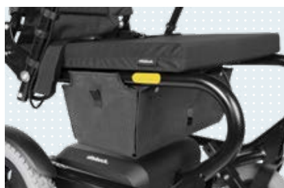
• Small storage bag underneath the seating area

i You may request the instructions for use with comprehensive information on the product as a PDF file at the email address oa@ottobock.com . The PDF file can also be displayed in a larger size.