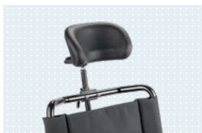
• Adapter for head support mounting kit